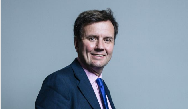
Greg Hands Parliamentary Under Secretary of State in the Department for Business and Trade