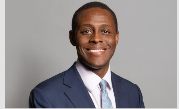
Bim Afolami Economic Secretary to the Treasury Parliamentary career

Parliamentary Under-Secretary of State for: Sport, Tourism and Heritage/Sport and Tourism 2020-22, Heritage and Civil Society 2021-22; Assistant Government Whip 2019-21; Government Whip, Lord Commissioner of HM Treasury 2022-23; Parliamentary Under-Secretary of State for International Trade, Department for International Trade 2022-23; Minister of State for International Trade, Department for Business and Trade 2023-