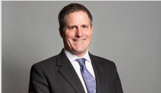
Anthony Browne Parliamentary Under Secretary of State