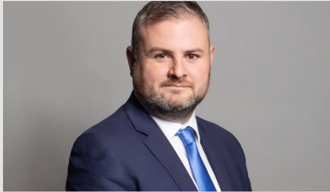
Andrew Stephenson Minister of State Parliamentary Career

Parliamentary Under-Secretary of State (Minister for Business and Industry), Department for Business, Energy and Industrial Strategy 2019; Minister of State: for Africa, Foreign and Commonwealth Office 19-20, Department for International Development 19-20, Department for Transport 2020-22; Minister without portfolio, Cabinet Office (attends Cabinet) 2022; Parliamentary Under-Secretary of State for Housing and Communities, Department for Levelling Up, Housing and Communities 2022; Member, Speaker's Committee on the Electoral Commission 2022