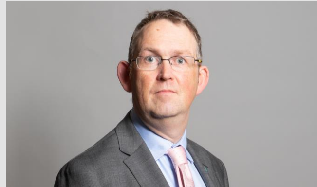
Paul Maynard Parliamentary Under Secretary of State

Minister of State, Department for Work and Pensions 2023-