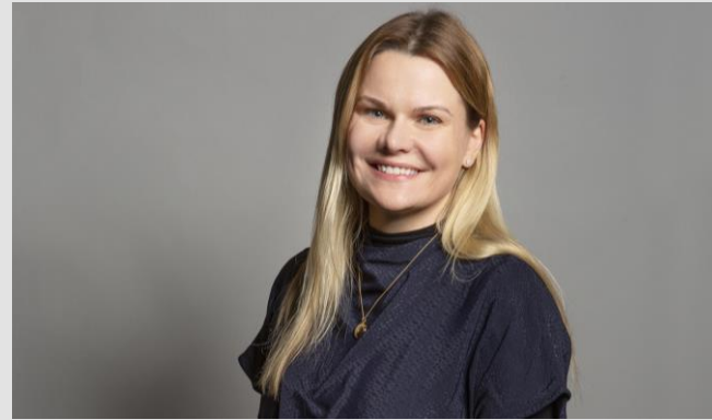
Laura Farris Parliamentary Under Secretary of State

Team PPS, Department for Work and Pensions 2021-22; PPS to: Jacob Rees-Mogg as Minister of State for Brexit Opportunities and Government Efficiency 2022, Brandon Lewis as Lord Chancellor and Secretary of State for Justice 2022; Team PPS, Ministry of Justice 2022-23; PPS to Stephen Barclay as Secretary of State for Health and Social Care 2023