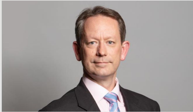
Gareth Bacon Parliamentary Under Secretary of State