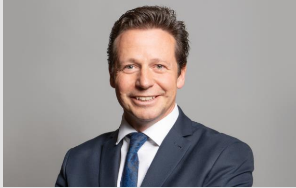
Nigel Huddleston Financial Secretary to the Treasury

Team PPS, Department for Transport 2020; PPS to: Grant Shapps as Secretary of State 2020-22, Nadhim Zahawi as Chancellor of the Duchy of Lancaster, Minister for Intergovernmental Relations and Minister for Equalities 2022; Parliamentary Under-Secretary of State for Pensions, Department for Work and Pensions 2022-23; Chief Secretary to HM Treasury 2023-