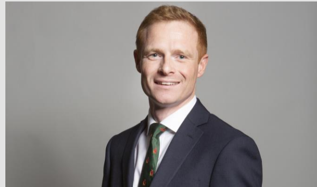
Robbie Moore Parliamentary Under Secretary of State, DEFRA

Department for Environment, Food and Rural Affairs: Team PPS 2020-21, PPS to George Eustice as Secretary of State 2021- 22; PPS to Mark Spencer as Leader of the House of Commons and Lord President of the Council 2022; Assistant Government Whip 2022-2023