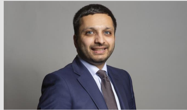
Sajib Bhatti Parliamentary Under Secretary of State

UK Net Zero Business Champion 2020-21; Adviser on Sustainable Infrastructure Investment 2021; PPS to Boris Johnson as Prime Minister 2021-22; Parliamentary Secretary (Minister for Policy and Head of the Prime Minister's Policy Unit), Cabinet Office 2022; Parliamentary Under-Secretary of State (Minister for Exports), Department for International Trade 2022; HM Treasury: Financial Secretary and City Minister 2022, Economic Secretary and City Minister 2022-