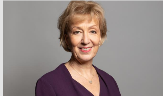
Andrea Leadsom Parliamentary Under Secretary of State

Parliamentary Under-Secretary of State (Minister for Business and Industry), Department for Business, Energy and Industrial Strategy 2019; Minister of State: for Africa, Foreign and Commonwealth Office 19-20, Department for International Development 19-20, Department for Transport 2020-22; Minister without portfolio, Cabinet Office (attends Cabinet) 2022; Parliamentary Under-Secretary of State for Housing and Communities, Department for Levelling Up, Housing and Communities 2022; Member, Speaker's Committee on the Electoral Commission 2022