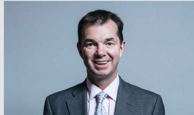
Guy Opperman Parliamentary Under Secretary of State