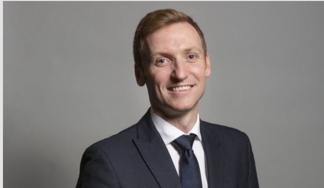
Lee Rowley Minister for Housing