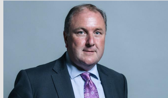
Simon Hoare Parliamentary Under Secretary of State

Team PPS, HM Treasury 2019-20; Parliamentary Under-Secretary of State (Minister for Industry), Department for Business, Energy and Industrial Strategy 2021-22; Government Whip, Lord Commissioner of HM Treasury 2021-22; Department for Levelling Up, Housing and Communities: Parliamentary Under-Secretary of State for: Housing 2022, Local Government and Building Safety 2022-23, Minister of State for Housing 2023-;