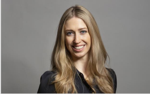
Laura Trott Chief Secretary to the Treasury, HM Treasury