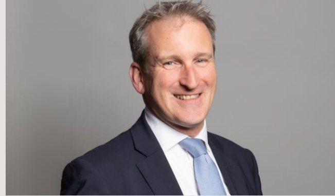
Damian Hinds Minister of State, Department for Education

Chief Secretary to the Treasury 2015-16; Department for International Trade: Minister of State for: Trade and Investment 2016-17, Trade Policy 2017-18, 2020-21, 2022-23; Minister for London 2017-18; Minister of State for Energy, Clean Growth and Climate Change, BEIS 2021-22; Minister without portfolio, Cabinet Office 2023; Minister of State, Department of Business and Trade 2023-