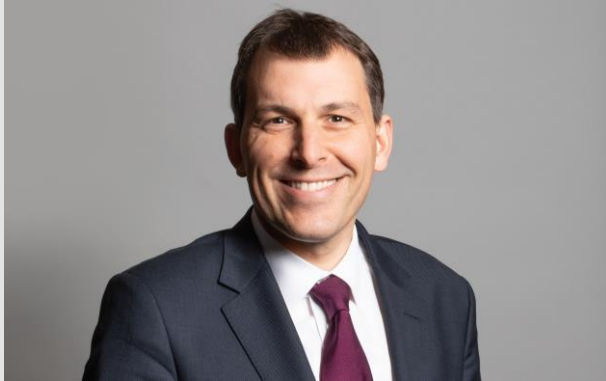
John Glen Minister for the Cabinet Office and HM Paymaster General