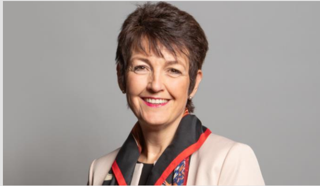
Jo Churchill Minister of State