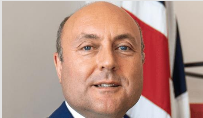
Andrew Griffith Minister of State