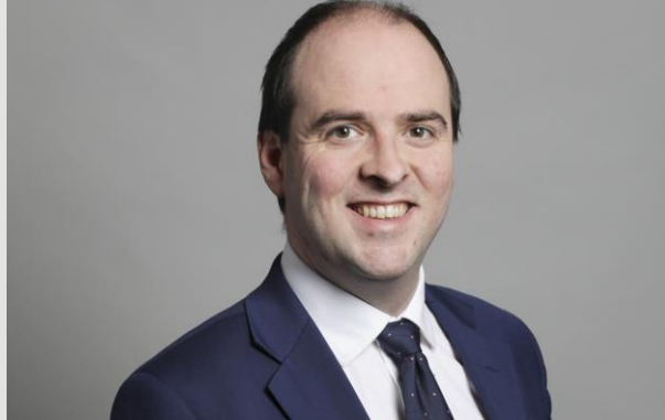
Richard Holden Conservative Party Chair

Parliamentary Under-Secretary of State for Arts, Heritage and Tourism, Department for Digital, Culture, Media and Sport 2017-18; HM Treasury: Economic Secretary (Minister for the City of London) 2018-21, Minister of State (Economic Secretary and City Minister) 2021-22, Chief Secretary to the Treasury 2022-23; Paymaster General, Minister for the Cabinet Office 2023-