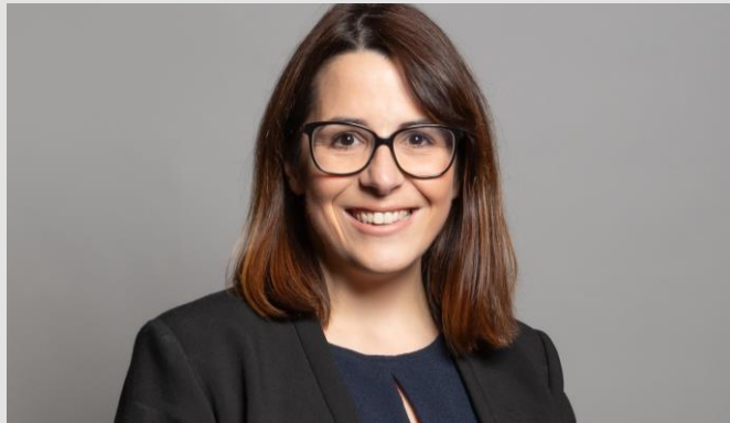
Fay Jones Parliamentary Under Secretary of State in the Wales Office