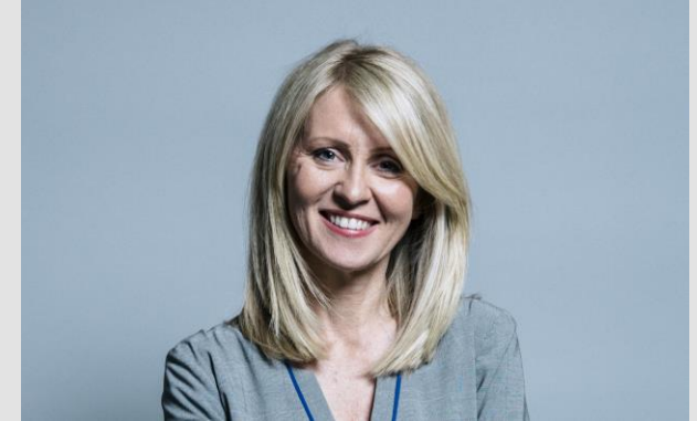
Esther McVey Minister without Portfolio (Minister for Common Sense)

Team PPS, Department for Digital, Culture, Media and Sport 2022; PPS to Kemi Badenoch Secretary of State for International Trade, President of the Board of Trade and Minister for Women and Equalities 2022; Parliamentary Under-Secretary of State for Roads and Local Transport, Department for Transport 2022-